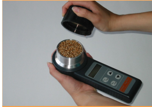
Figure 1a. Fill the measuring cell evenly to the top, ensuring the crop is level with the top of the cell. Screw on the cap and tighten until the stainless steel pressure indicator is flush with the top of the cap.