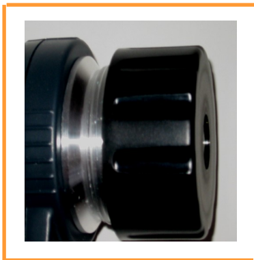
Figure 1 b

✘ Screw cap under tightened. Stainless steel indicator sunken in cap