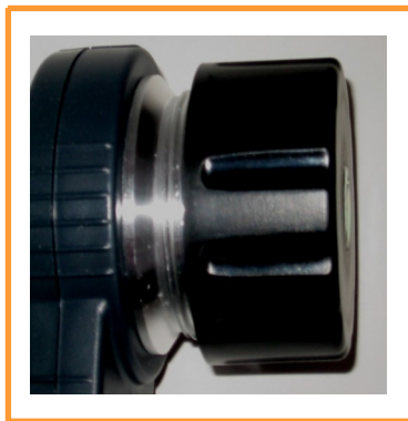
Figure 1 c

✘ Screw cap under tightened. Stainless steel indicator sunken in cap