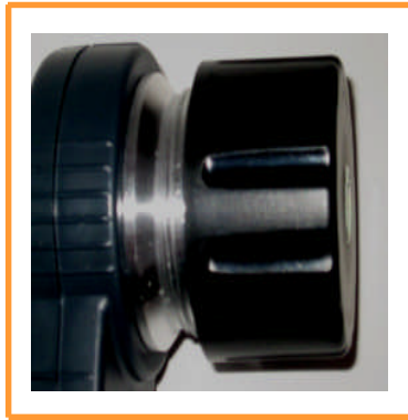
Figure 1 c

✘ Screw cap under tightened. Stainless steel indicator sunken in cap